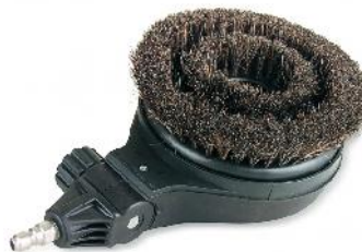
P/N 110984 ROTATING BRUSH