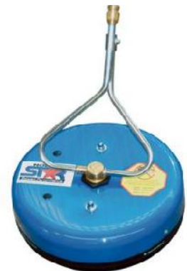
P/N 101079 WALL & SURFACE CLEANER