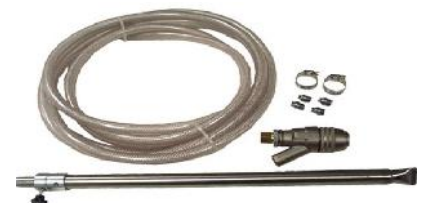
P/N 201107 SANDBLASTING PACK 500 BAR