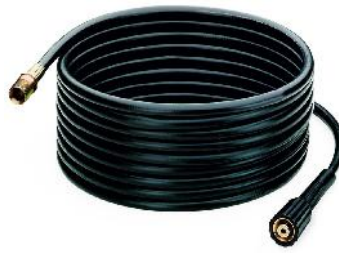
P/N 101177 HIGH PRESSURE EXTENSION HOSE 20 MTR