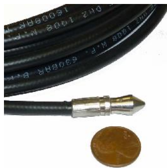
P/N 201113 PIPE CLEANING HOSE 20MTR WITH MICRONOZZLE