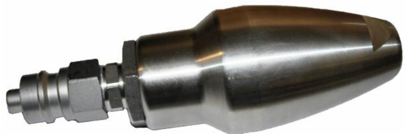
P/N 201106 TURBONOZZLE QR PACK 500 BAR