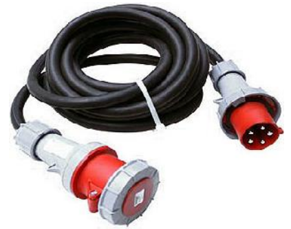
P/N 201102 EXTENSION CABLE 50MTR, WITH WATERPROOF CONNECTORS